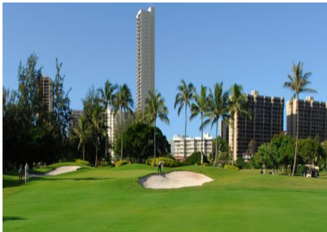
Honolulu Country Club

ASHRAE (American Society of Heating Refrigerating & Air-Conditioning Engineers, Inc.)