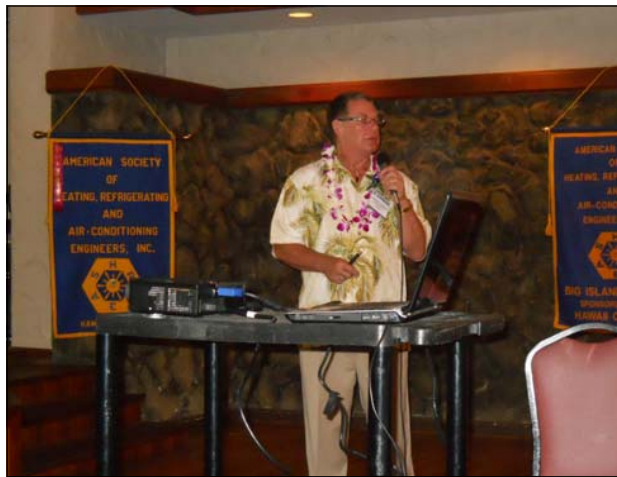
ASHRAE Knowledge and Practical Solutions