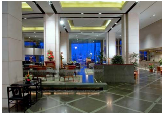
Hawaii Prince Hotel Lobby – Marina Front