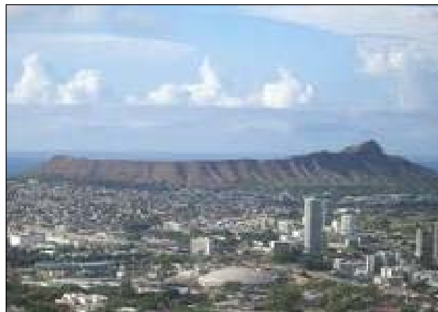
Diamond Head, Waikiki Beach, Oahu, Hawaii

American Society of Heating Refrigerating Air-Conditioning Engineers, Inc.