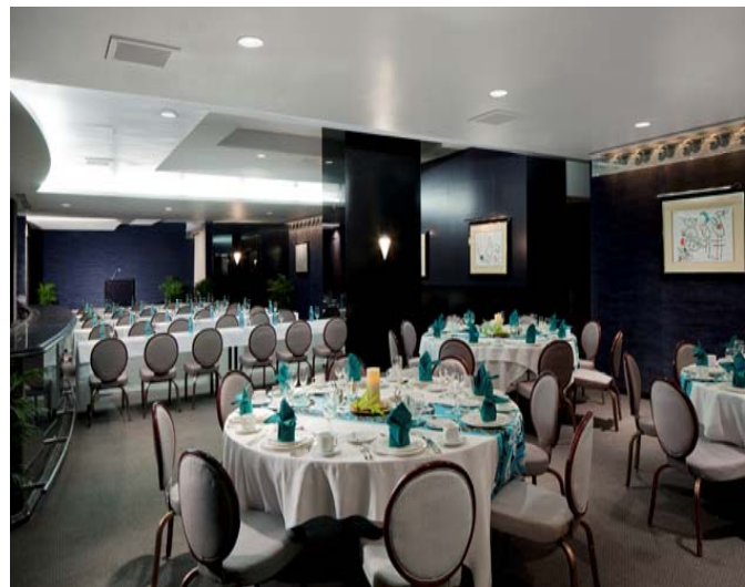
The Captain’s Room

The standard for sophistication in Waikiki, this ocean-front property features every room with panoramic views, the finest island cuisine, and a unique 27-hole championship golf course.